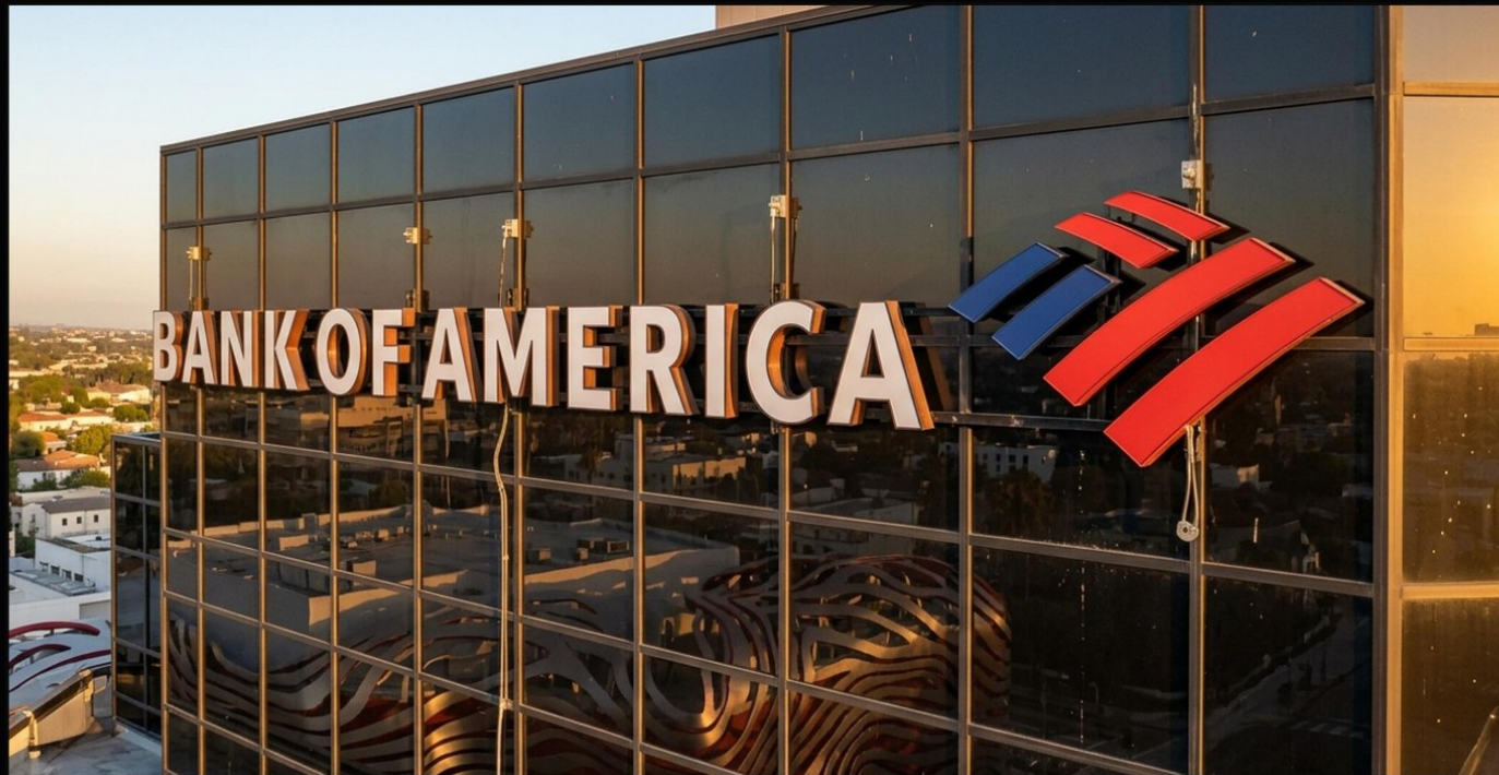
FIG. 01 · TOP-OF-FACADE WORDMARK, GOLDEN HOUR

Top-of-building rights deliver a permanent, illuminated wordmark visible from Wilshire, Fairfax, and the surrounding cultural campus.